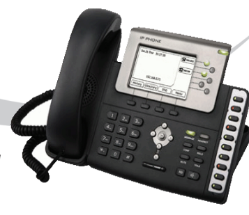
6 Lines w/Full-duplex speaker HD Voice Quailty 16 Programmable w/LED Keys 4 Soft Keys SIP/NAT/STUN/IEEE 802.1p/VLAN POE support w/2 RJ45 Ports Expension module support