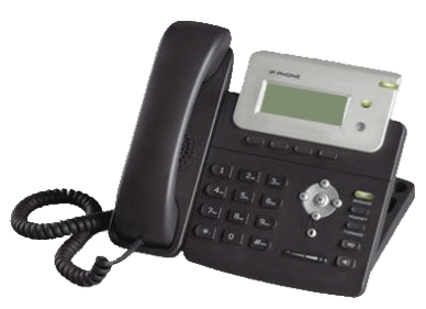
2 Lines w/ Full-duplex speaker HD Voice Quailty 2 Programmable 23 Hard Keys & 2 indicattion LED SIP/NAT/STUN/IEEE 802.1p/VLAN POE support w/2 RJ45 Ports