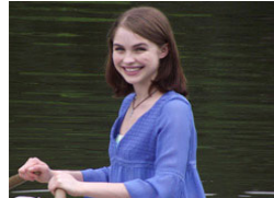
18x Optical Zoom