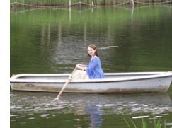
5x Optical Zoom